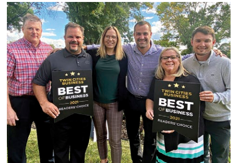
TopLine Mortgage Team

Thank you for making TopLine one of the top three Best Credit Unions in Minnesota.