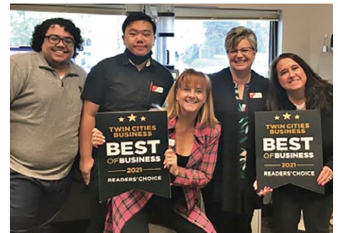
TopLine Como Park Branch