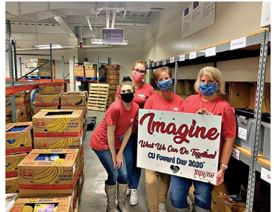
Volunteers from last year's TopLine CU Forward Day