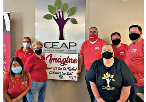
Volunteers from last year's TopLine CU Forward Day