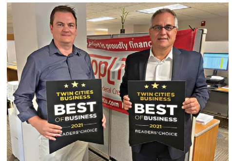
TopLine Business Lending