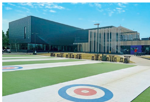
TopLine's Lawn Bowling Fundraiser was held at Brookview Golf and Lawn Bowling.

TopLine Credit Union Foundation hosted its Sixth Charitable Lawn Bowling Fundraiser on Thursday, June 30th! It was a great day for all filled with lawn bowling, fundraising, networking and more! Proceeds are