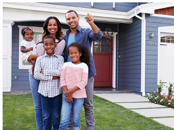
Your home payment may most likely be lower than renting!

TopLine is a full-service mortgage lender. We offer just about every kind of home loan available. Whether you are looking for a conventional mortgage, FHA, VA, second mortgage or jumbo we'll explain your options and help you save money with our competitive rates.