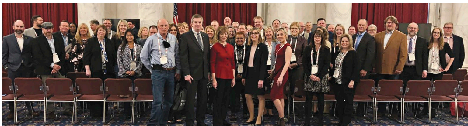
Minnesota Credit Union delegation with U.S. Senator Tina Smith.

During their visits on Capitol Hill, the group met with U.S. Senators Amy Klobuchar and Tina Smith as well as members of the U.S. House and their staff. Meetings focused on modernizing credit union service, securing data to protect consumer privacy and improve financial well-being.