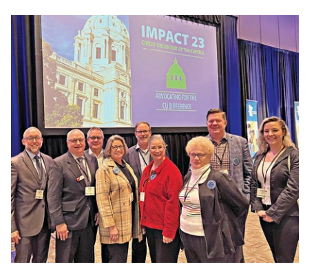
Leaders from your credit union participated in an advocacy event at the Minnesota Capitol to advocate for the credit union message with elected officials.

TopLine had the opportunity to be a part of IMPACT 23: CU Day at the Minnesota Capitol on January 25, 2023. This day provides credit union professionals and volunteers the unique opportunity to learn about legislative issues and meet with elected officials.