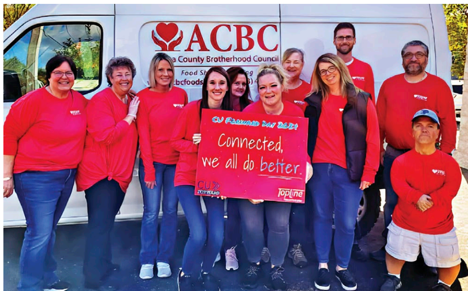
TopLine volunteers partnered with local non-profits.

Thank you for being a part of the TopLine family!