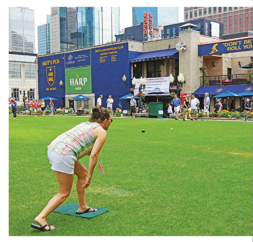
TopLine Credit Union Foundation is guided by its mission: to work within the community to build a better tomorrow.

If you would like to make a donation to the Foundation<sup>†</sup>, please contact TopLine at 763-391-9494, email Foundation@TopLinecu.com, stop by any location or write to: 9353 Jefferson Highway, Maple Grove, MN 55369.