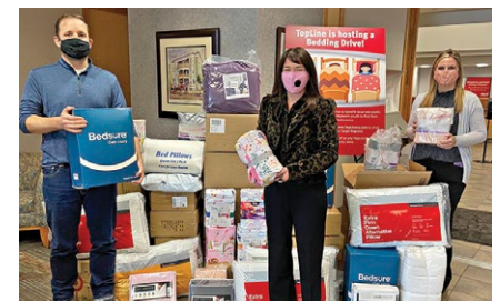
TopLine employees helped coordinate donations.

i To learn about other volunteer and donation opportunities, visit www.avenuesforyouth.org and www.ymcanorth.org .